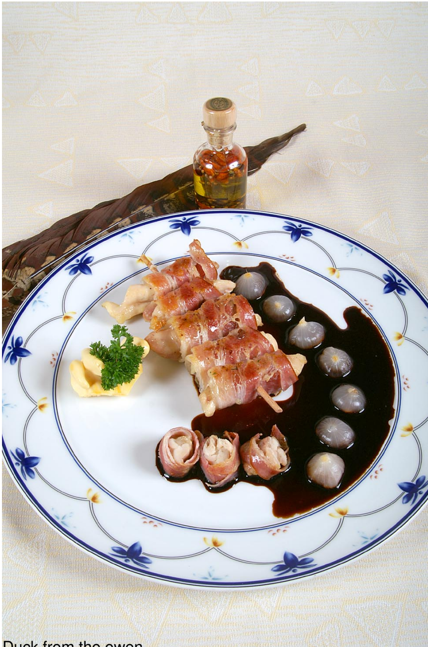
Duck from the oven